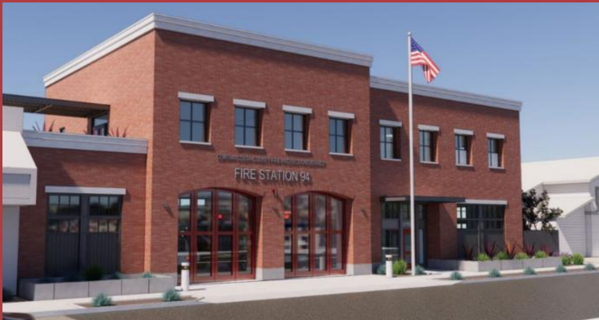
Fire Station 94 Downtown Brentwood