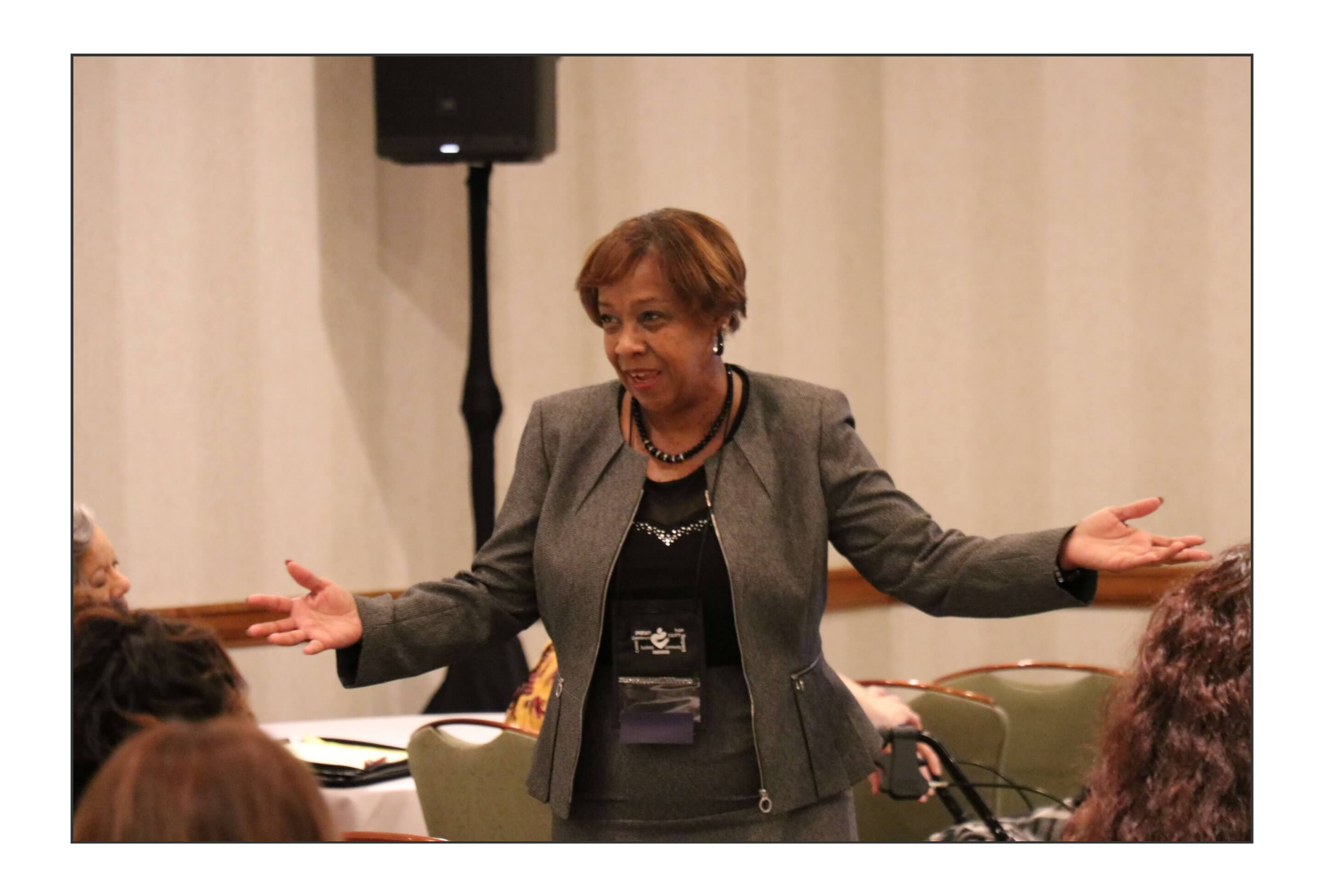
Sponsorship, Exhibit, and Advertising Opportunities