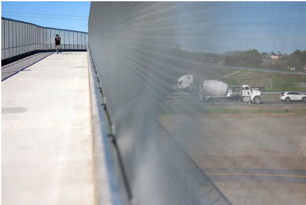
A pedestrian walks across the new Mokelumne Trail Bicycle and Pedestrian Overcrossing on Wednesday, March 20, 2024, in Brentwood, Calif. The overcrossing provides a safe access for cyclists and pedestrians over State Route 4 for commuting and recreational travel and is part of the Mokelumne Trail.

“Our residents will now have a safe bridge to access the Mokelumne Trail, which opens so many possibilities for families and people,” she said. “Now that the trail is officially connected, cyclists, trail walkers and those seeking environmentally friendly ways to travel can get to where they need to go.”