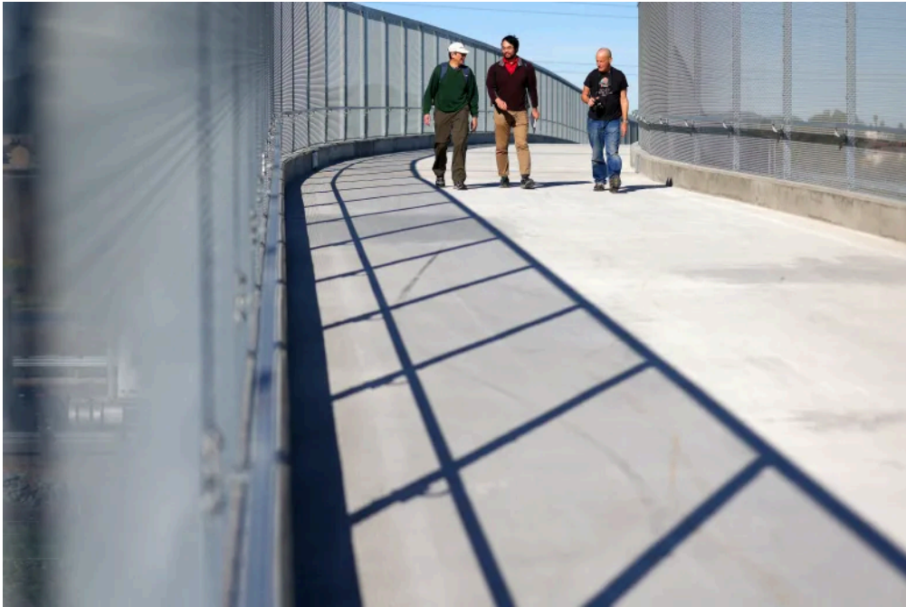
Pedestrians walk across the new Mokelumne Trail Bicycle and Pedestrian Overcrossing on Wednesday, March 20, 2024, in Brentwood, Calif. The overcrossing provides a safe access for cyclists and pedestrians over State Route 4 for commuting and recreational travel and is part of the Mokelumne Trail.