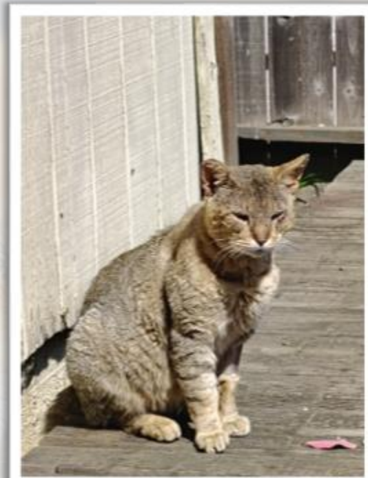
Animal Fix Clinic treated "Angel" with eye surgery, which was a low-cost procedure for his owner.