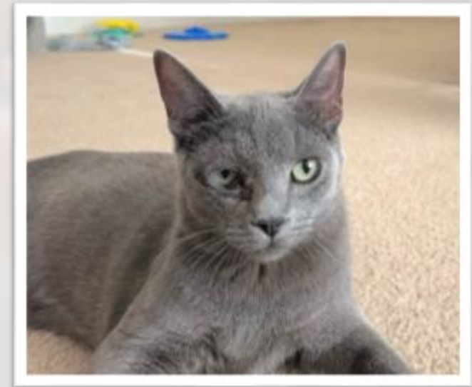
"Toby" was left at a local veterinary facility and had extensive eye issues, including necessary cyst removal. The Cat Support Network funded his surgeries and care.