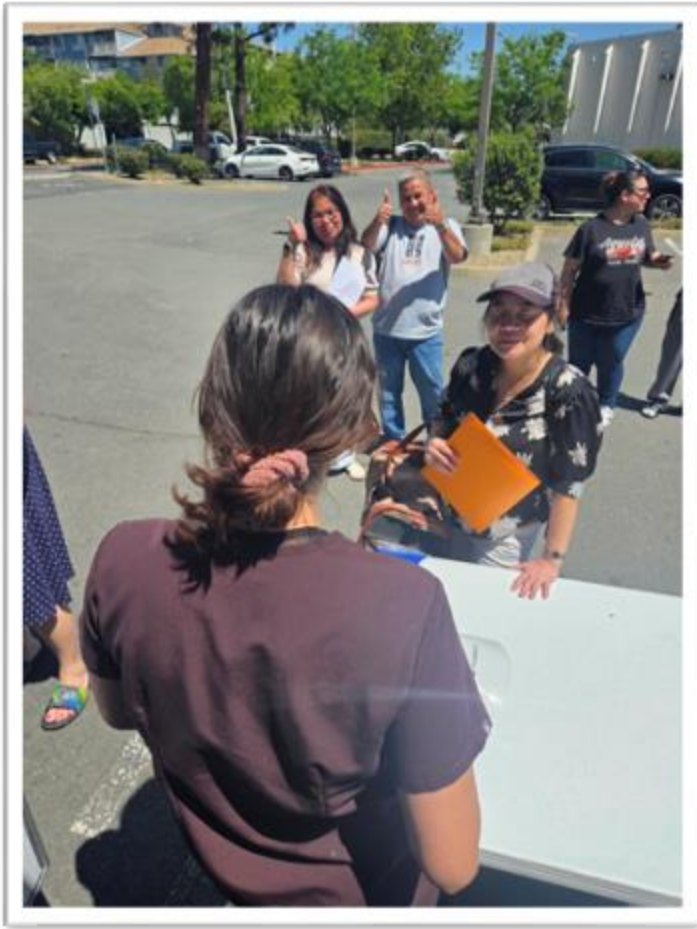
Joybound People and Pets mobile spay and neuter clinic check-in.