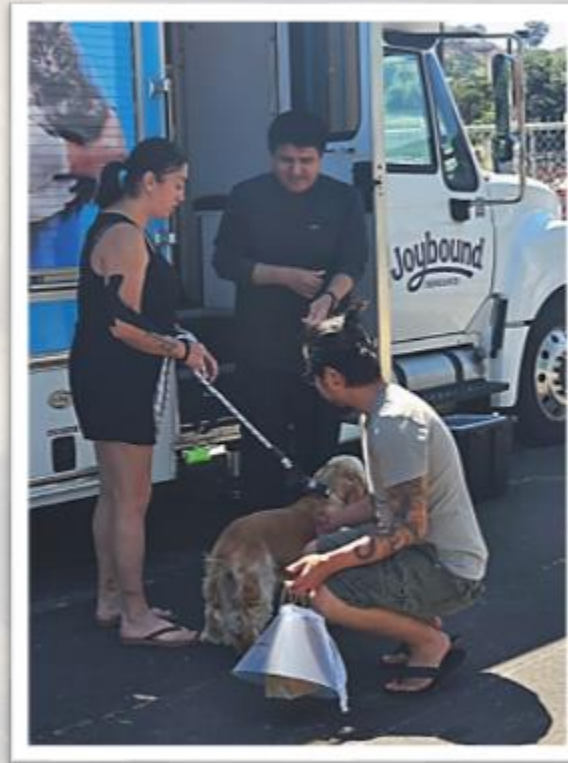
Joybound People and Pets hosted three (3) mobile spay and neuter clinics, including one at the CCAS campus.