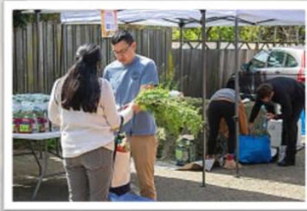
The House Rabbit Society supported 85 families at their monthly pantry events.