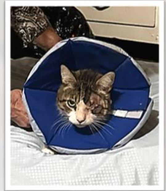
Pawsitively S.A.F.E helped "Max" and his owner address an eye issue he had been struggling with for months. After being diagnosed with glaucoma, he underwent surgery to remove the affected eye, bringing him comfort and a pain-free life.