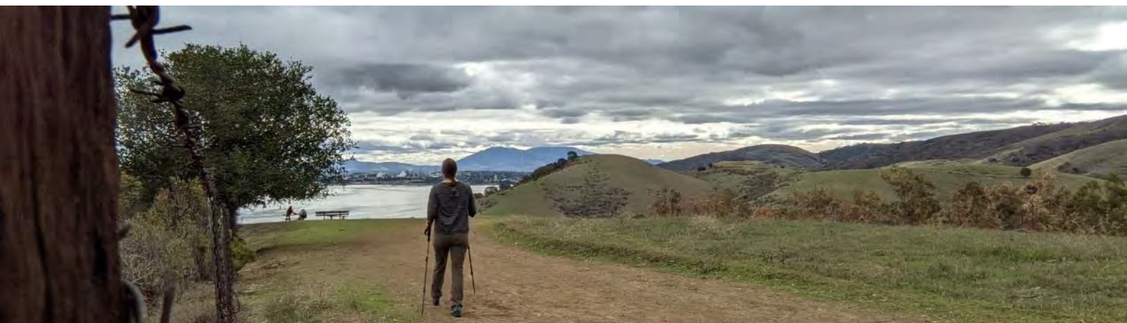
Photo of a hiker on the Carquinez Strait Scenic Loop Trail in the Carquinez Regional Shoreline

Recommendation: The Commission should continue to support EBRPD's work on this alignment. As new segments are completed and gaps are closed, those segments should be added to Delta Trail maps and Delta Trail logos should be added to trail signs.