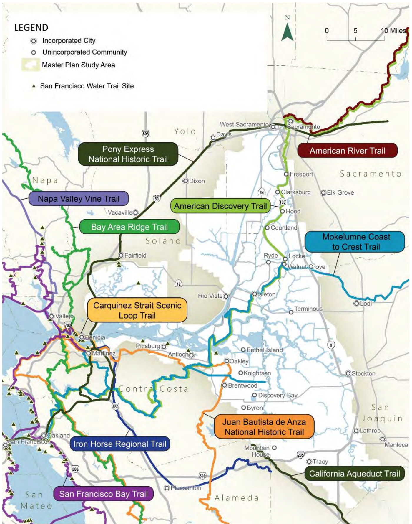
Figure 2-10: Map of Major Planned and Existing Regional Trails in and Around the Delta.