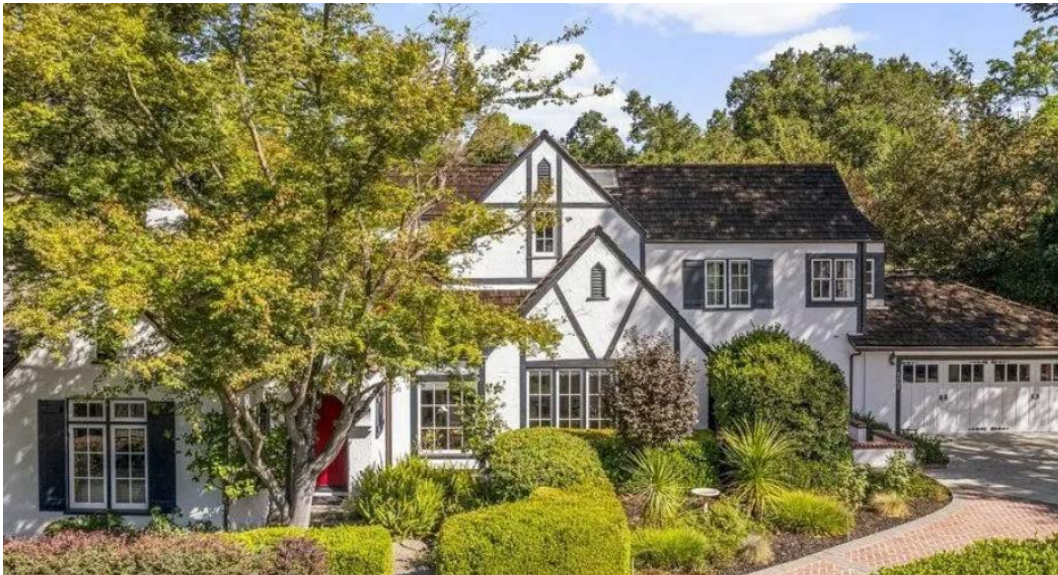
2067 Alameda Diablo, Diablo CA 94528 (2016)