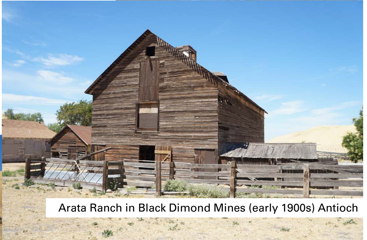
Arata Ranch in Black Dimond Mines (early 1900s) Antioch