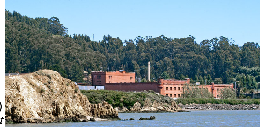
Winehaven (1907) Richmond right