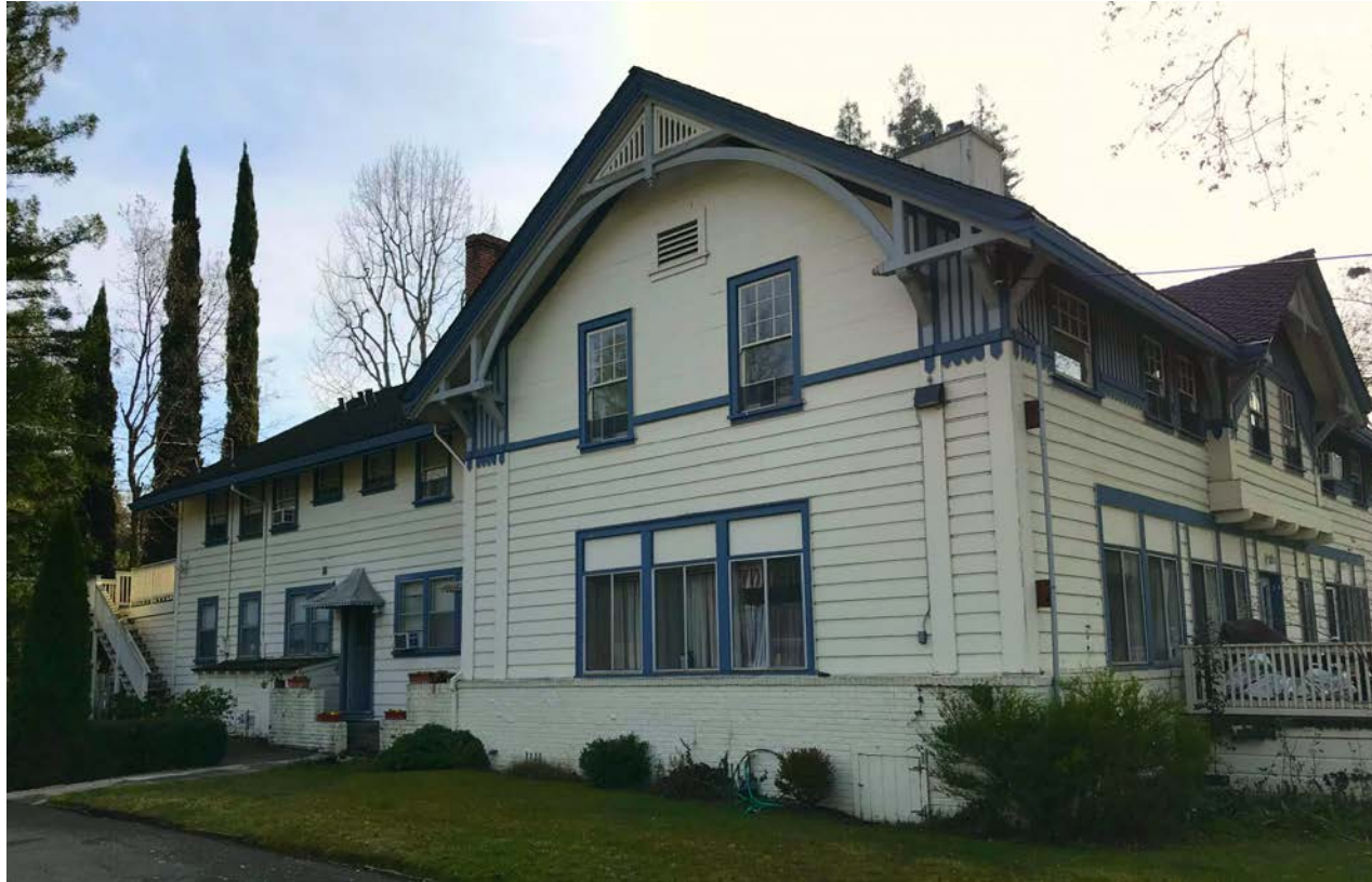
Red Horse Tavern (1917)