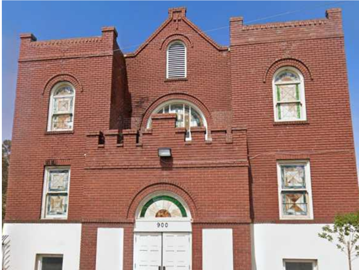
Pittsburg Seventh Day Adventist Church (1919)