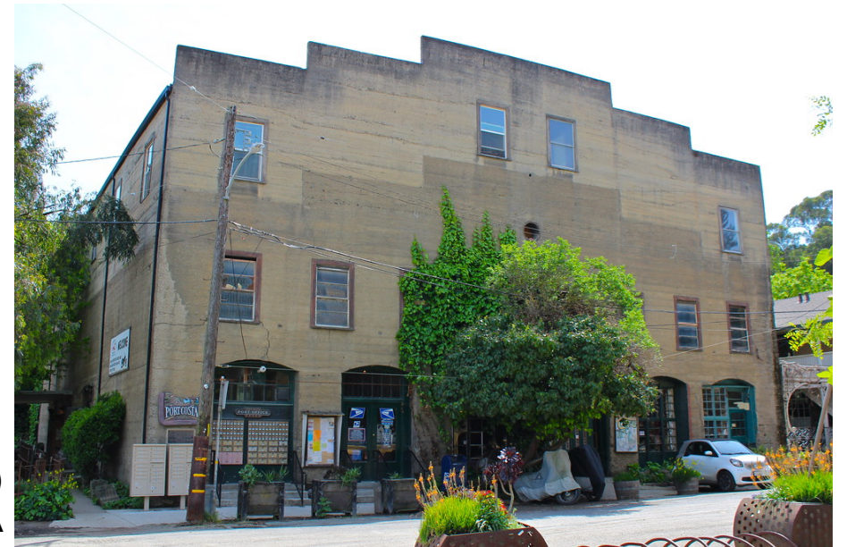
Warehouse cafe (1886) Port Costa, CA