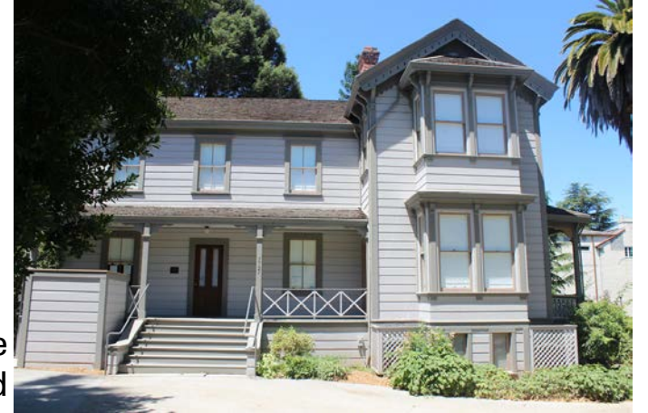
Don Francisco Galindo House (1856) Concord