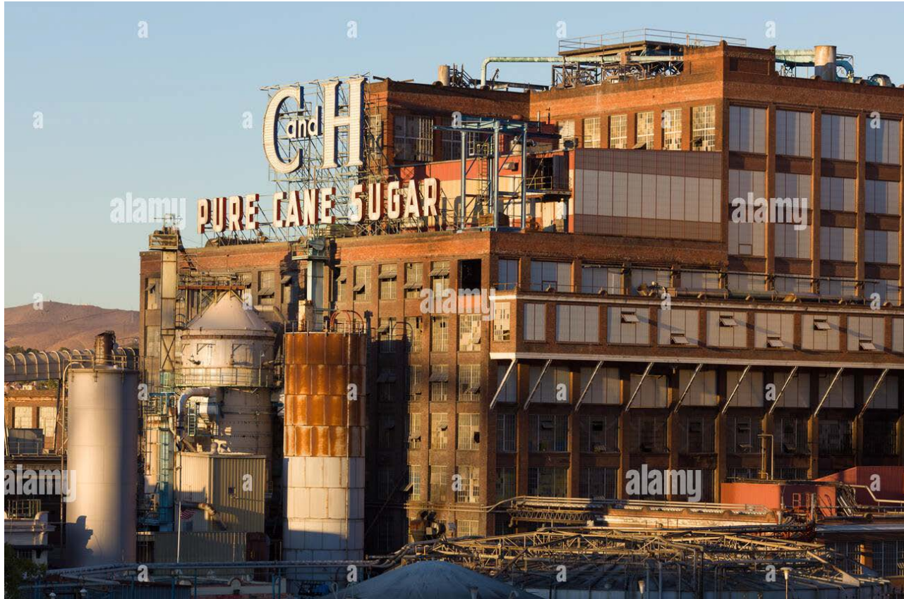
C & H Sugar Company (1884), Crockett