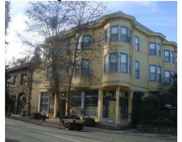
Burlington Hotel which (1883), Port Costa