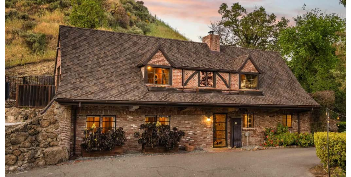
67 Stonecastle Road, Alamo CA 94507 (2016)