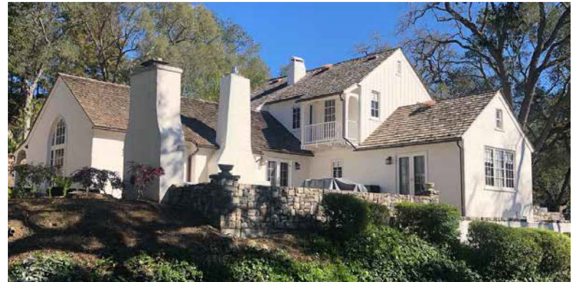
1897 Calle Arroyo, Diablo CA 94528 (2016)