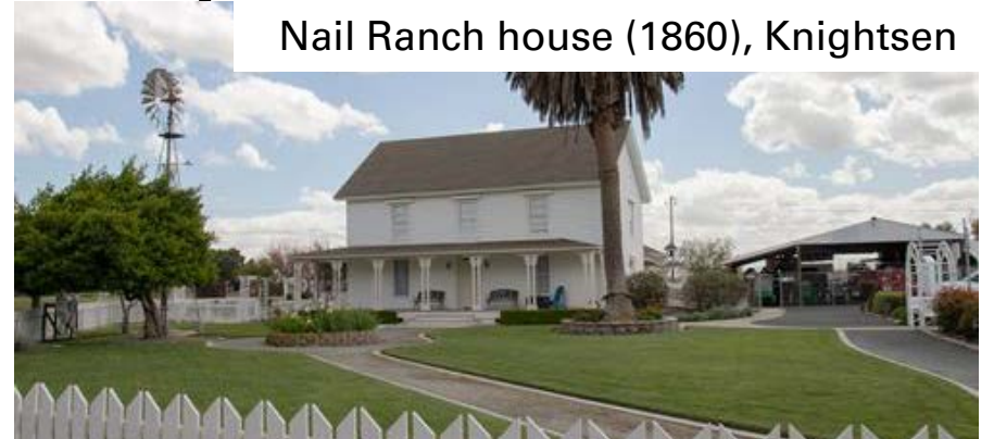
Nail Ranch house (1860), Knightsen