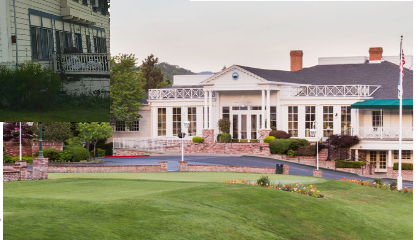
Diablo Country Club (1914)