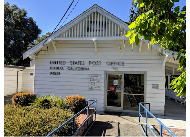
Diablo Post Office (1917)