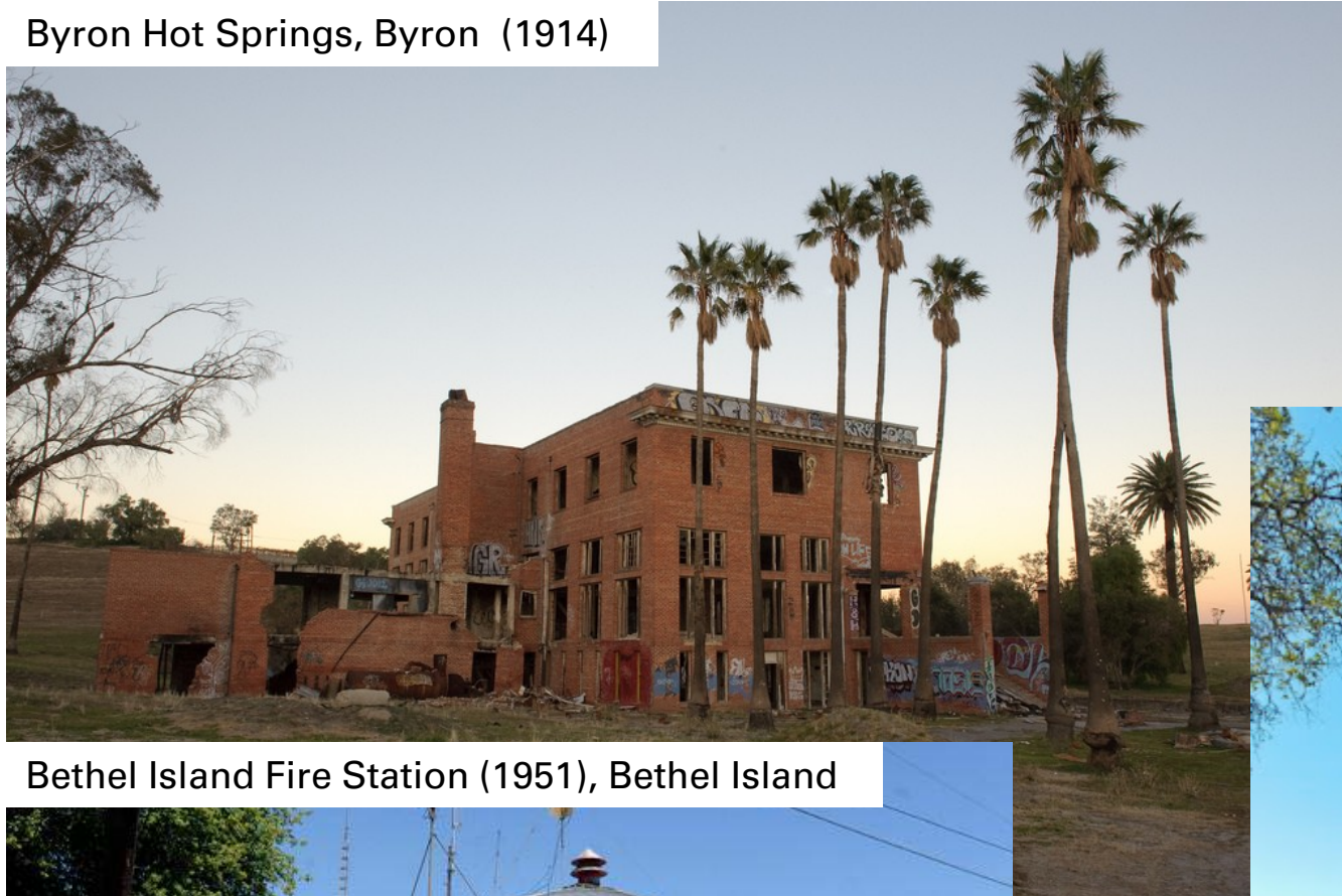
Byron Hot Springs, Byron (1914)