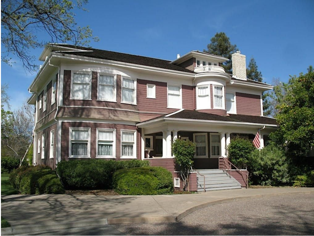
Shadelands Ranch (1856), Walnut Creek