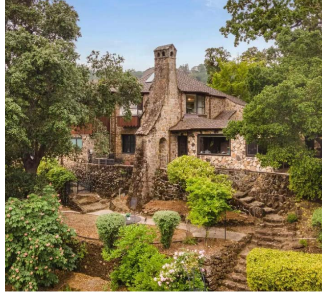
66 Stonecastle Road, Alamo CA 94507 (2016)