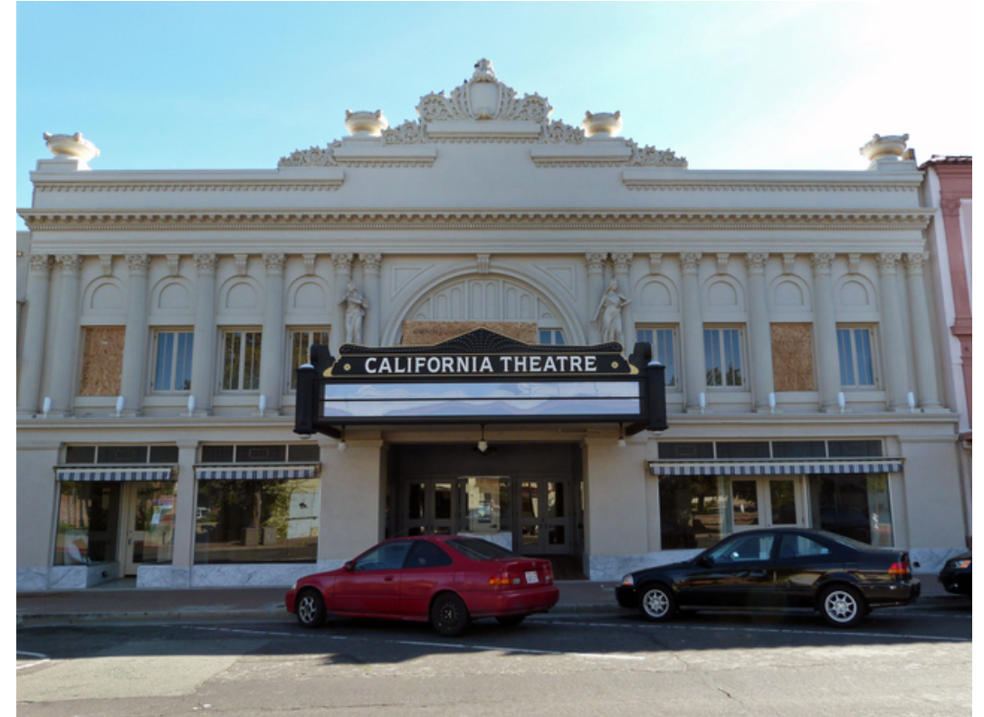
California Theatre (1920)