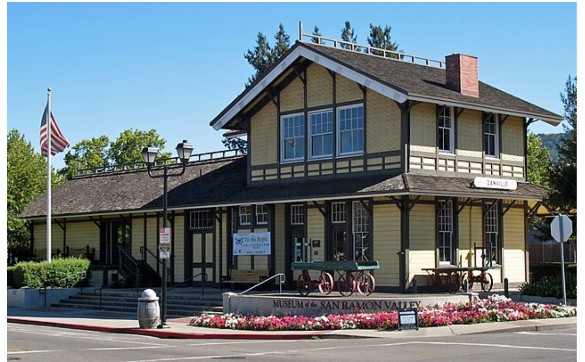
Danville Railroad Depot (1891), Danville