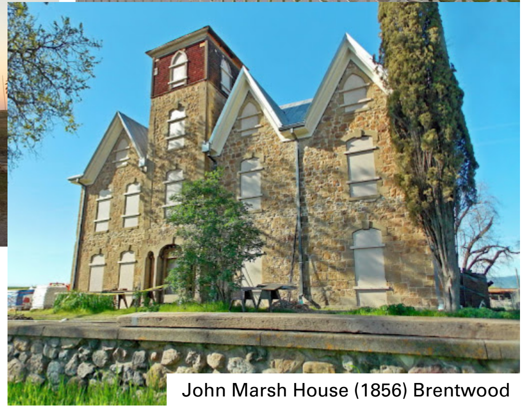
John Marsh House (1856) Brentwood