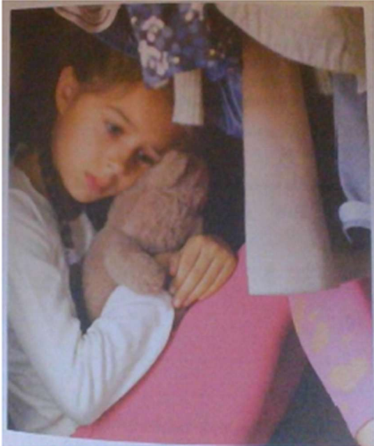
Child abuse impacts the child, family, community and society.