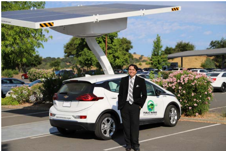
Department of Child Support Services staff with a new portable electric vehicle charger.