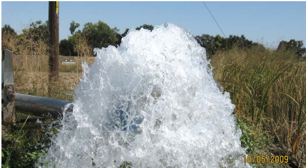
Irrigation pipe in East County