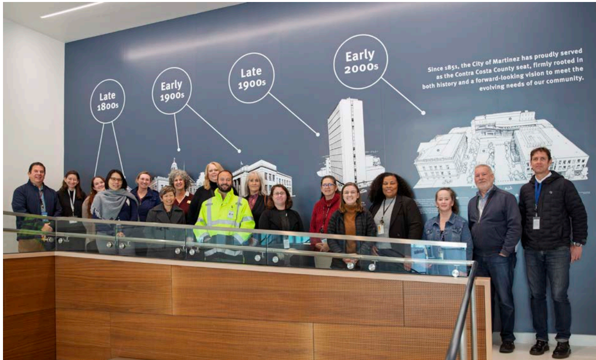
Green Government Group (G3) Champions tour the TRUE Gold- and LEED Platinum-certified new administration building at 1026 Escobar St.

The Department of Conservation and Development leads implementation of the CAAP.