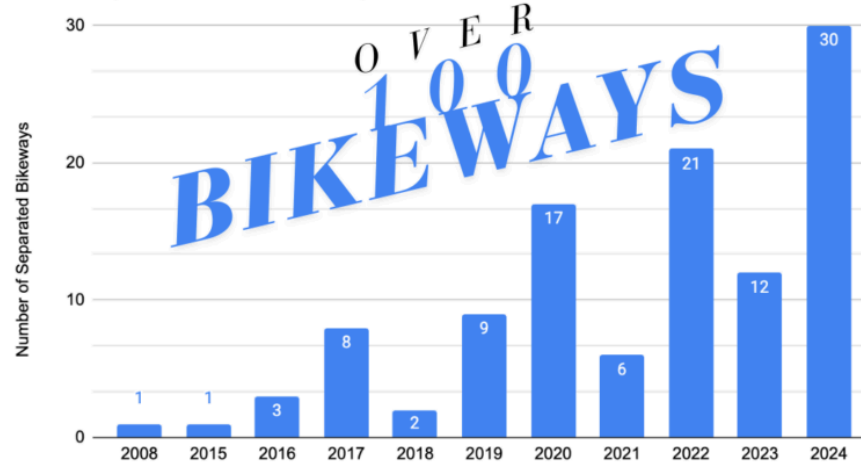
East Bay Separated Bikeways Completed Per Year

Separated bikeways (also known as protected or Class IV bikeways) are on or along a street, and have some sort of physical barrier between them and car traffic, not only paint. These are distinct from multi-use trails which have a shared right of way with pedestrians. Cities throughout California were not officially allowed to build separated bikeways until 2016!