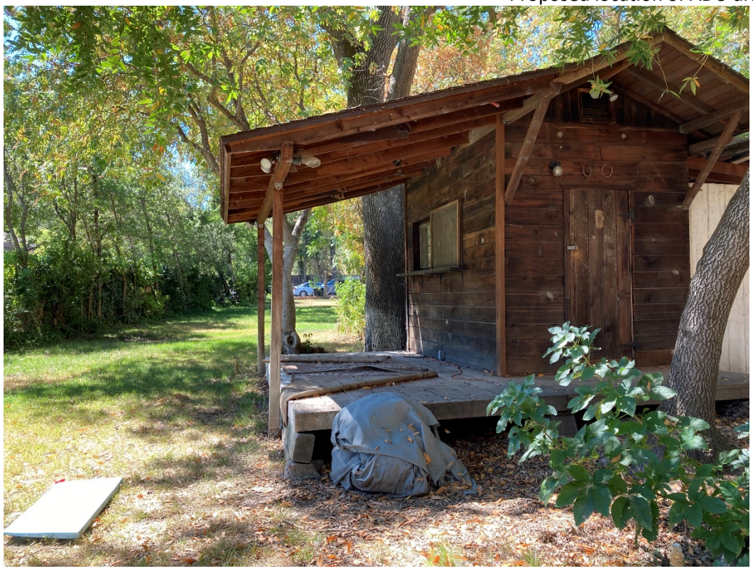
Existing shed proposed for demolition