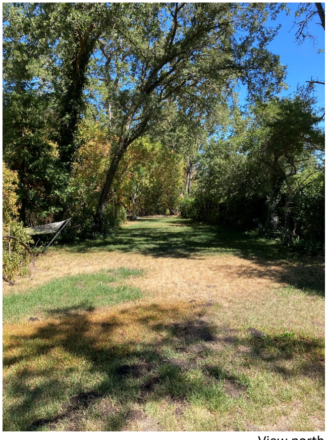
View north from center of property