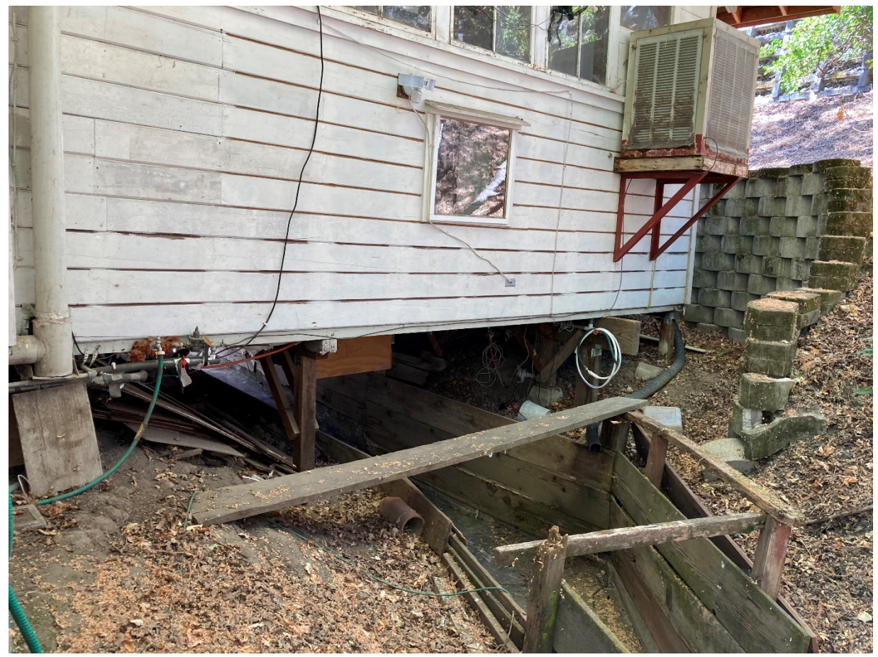
Creek/drainage ditch beneath existing home