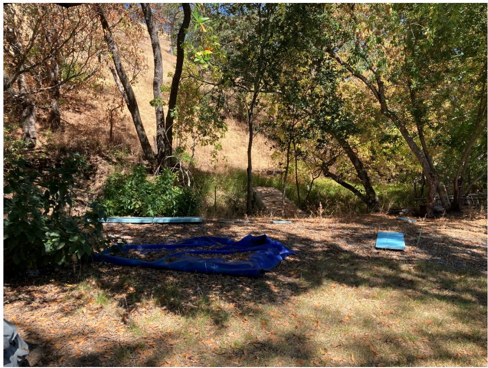
Proposed location of ADU