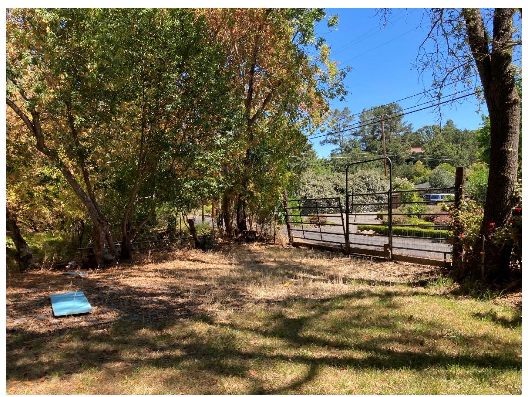
Proposed location of ADU driveway