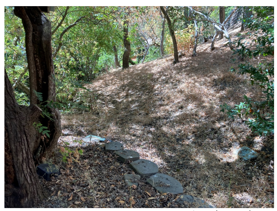
Area where creek runs underground