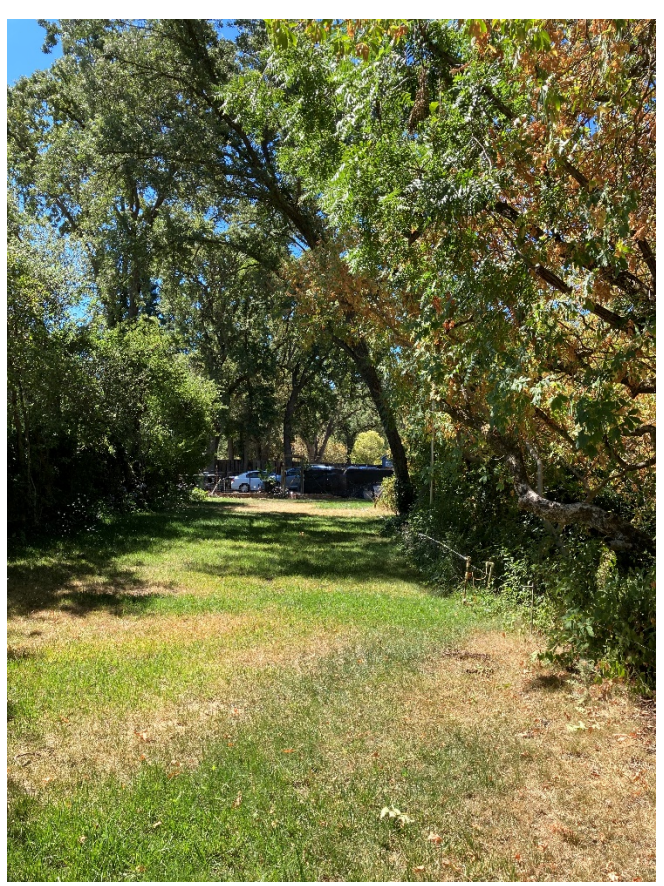
View south from center of property