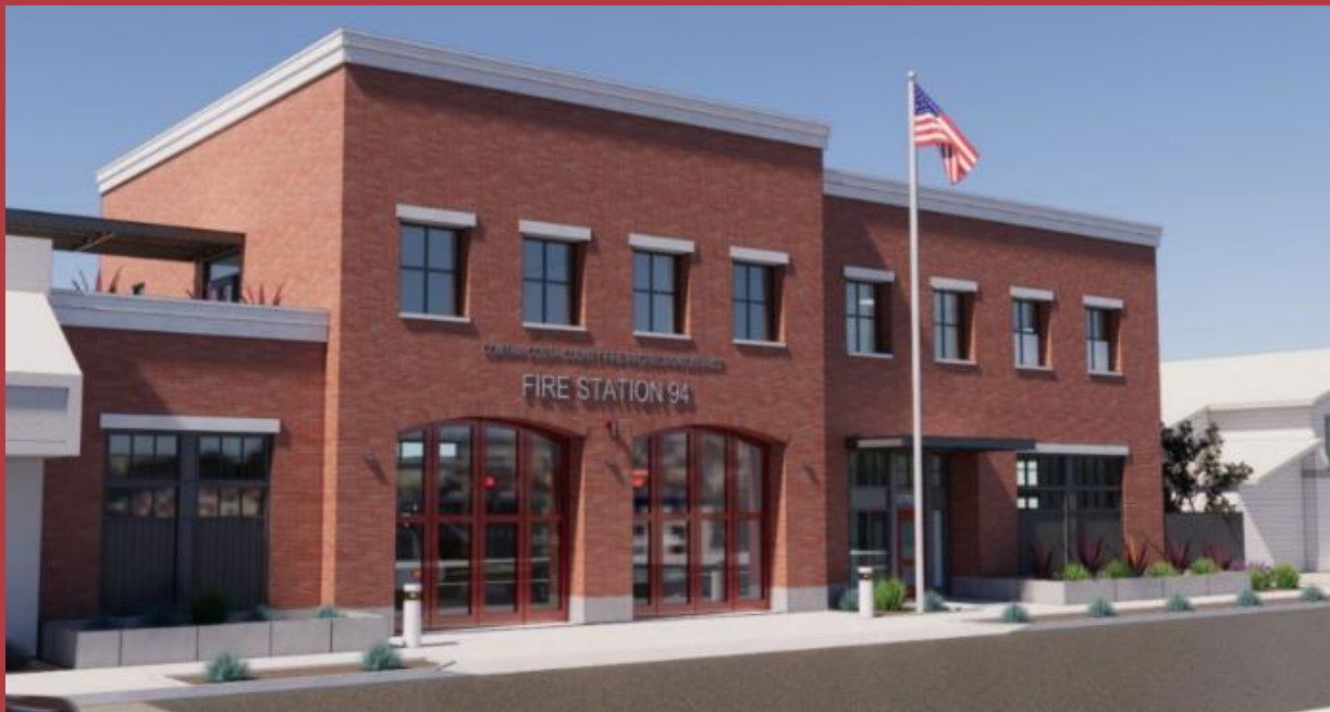
Fire Station 94 Downtown Brentwood