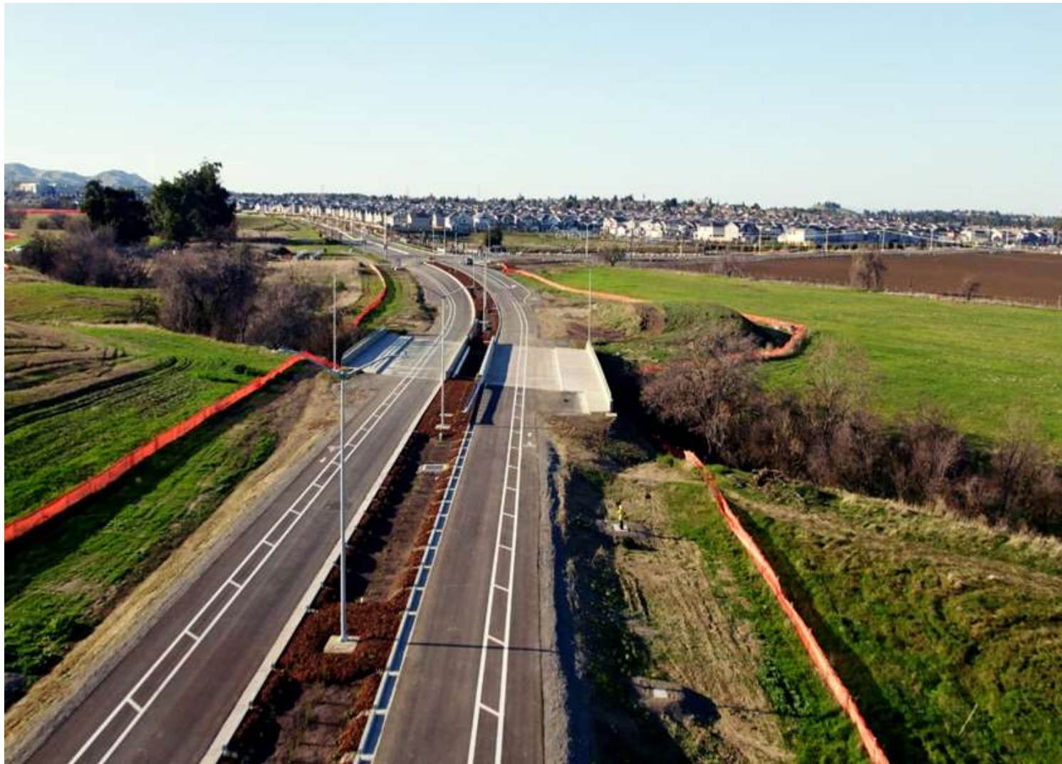
Sand Creek Road Extension