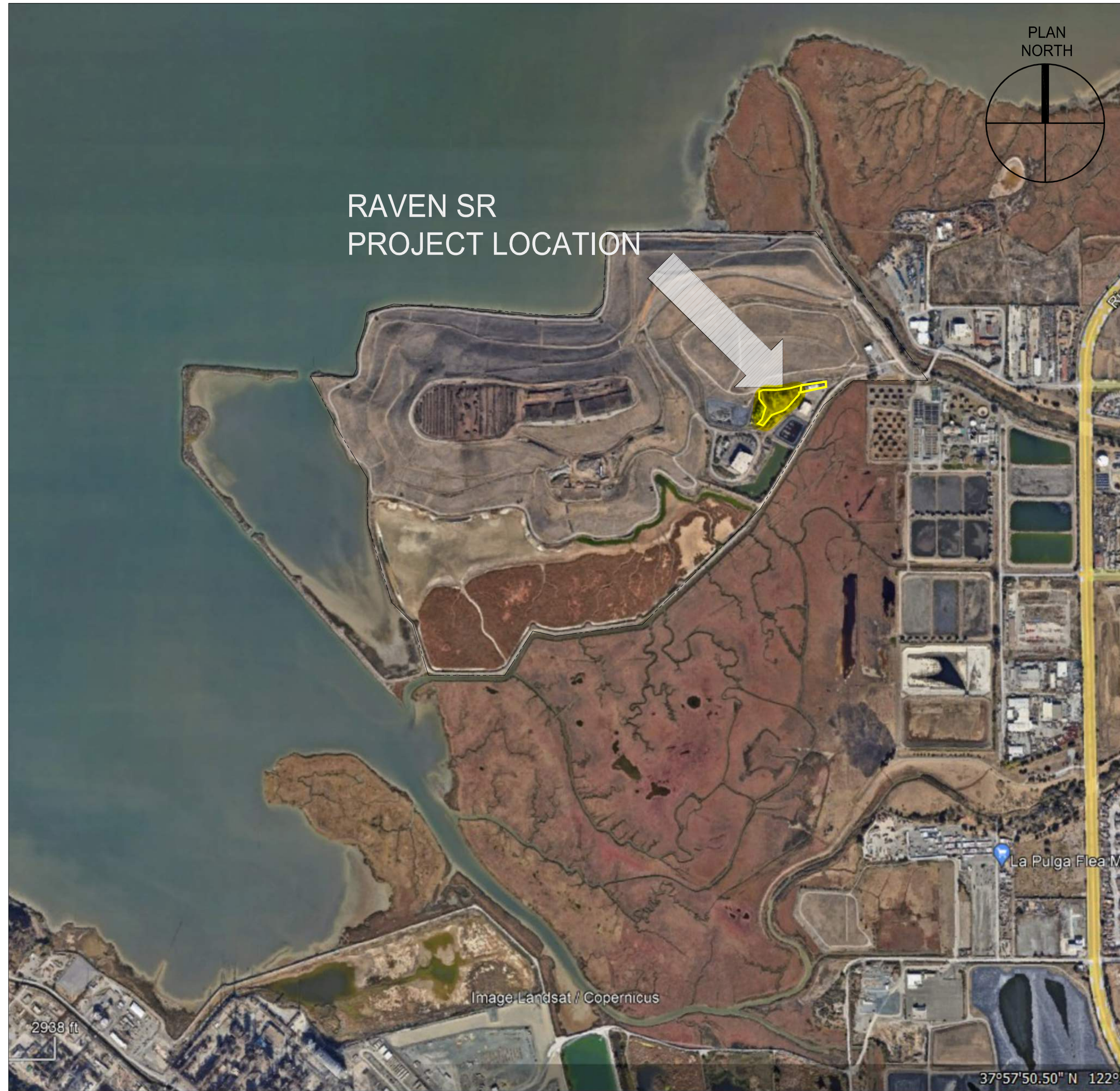
LOCATION MAP SCALE: NTS