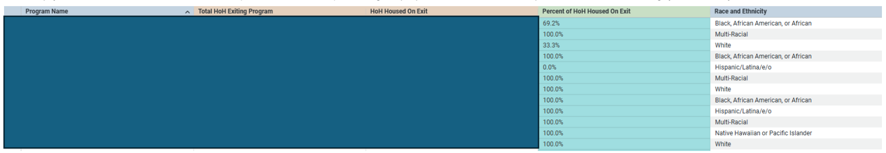
Housing Retention Status By Race (Prevention Only)

> This equity measure table includes the total number of households (based on head of household) exited during the report period, and of those the number and percent of those who exited to housing, by race and ethnicity.