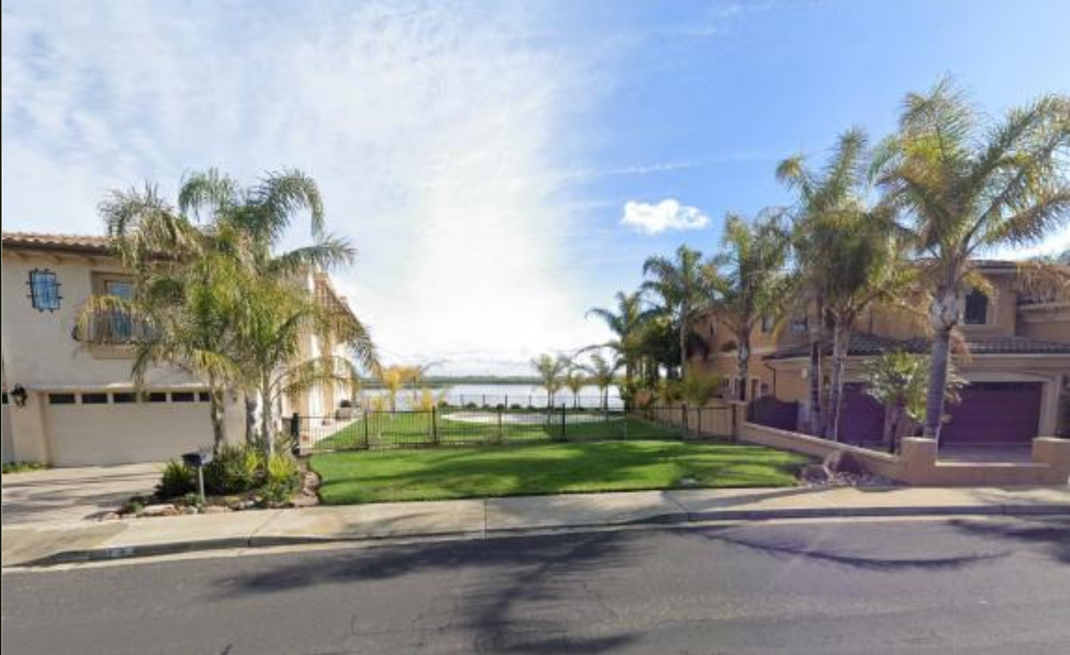
EXISTING SITE PHOTO