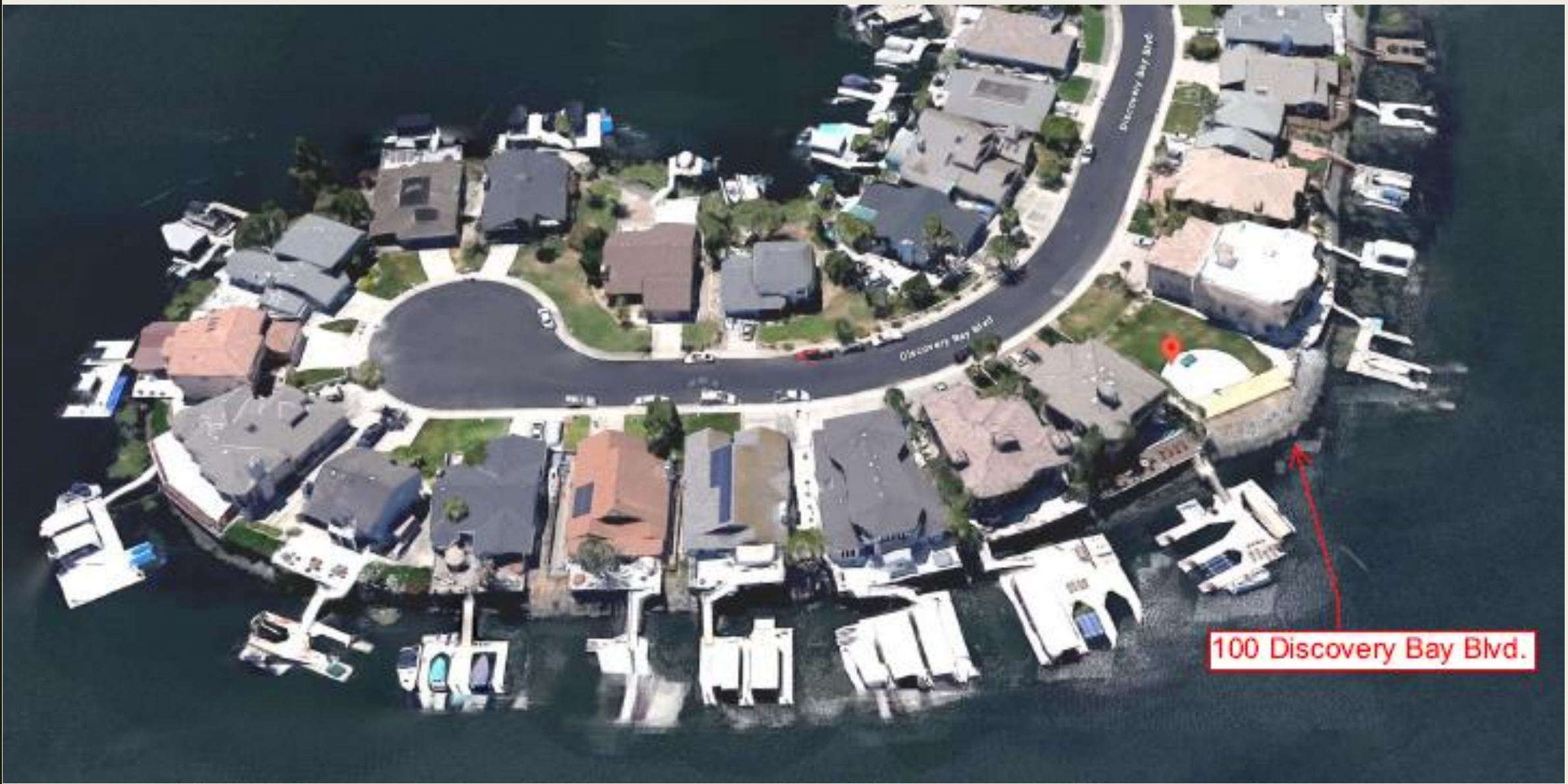
AERIAL SITE PHOTO