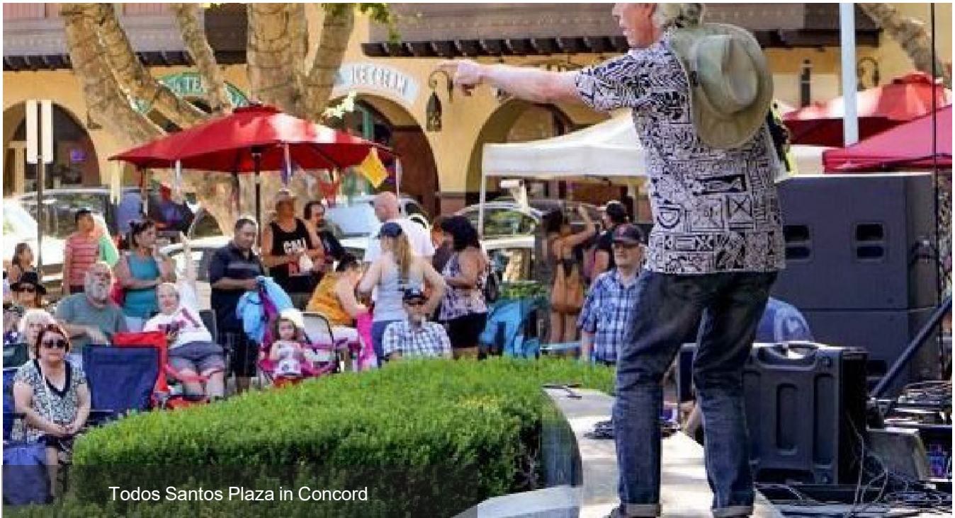
Todos Santos Plaza in Concord