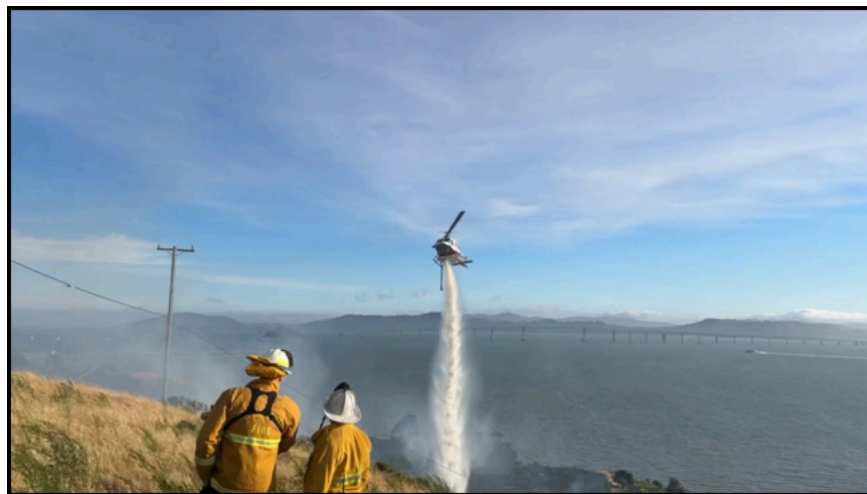
May 27, 2026, Mutual Aid to Richmond at Point Molate.