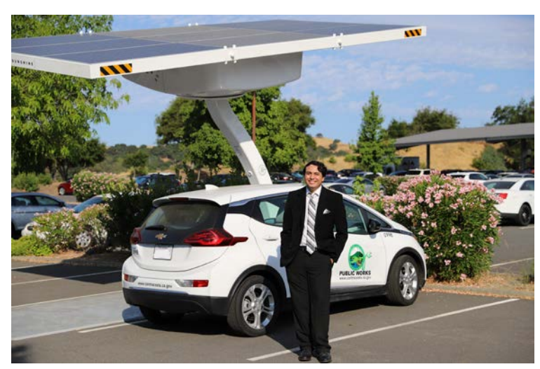
Department of Child Support Services staff with a new portable electric vehicle charger.