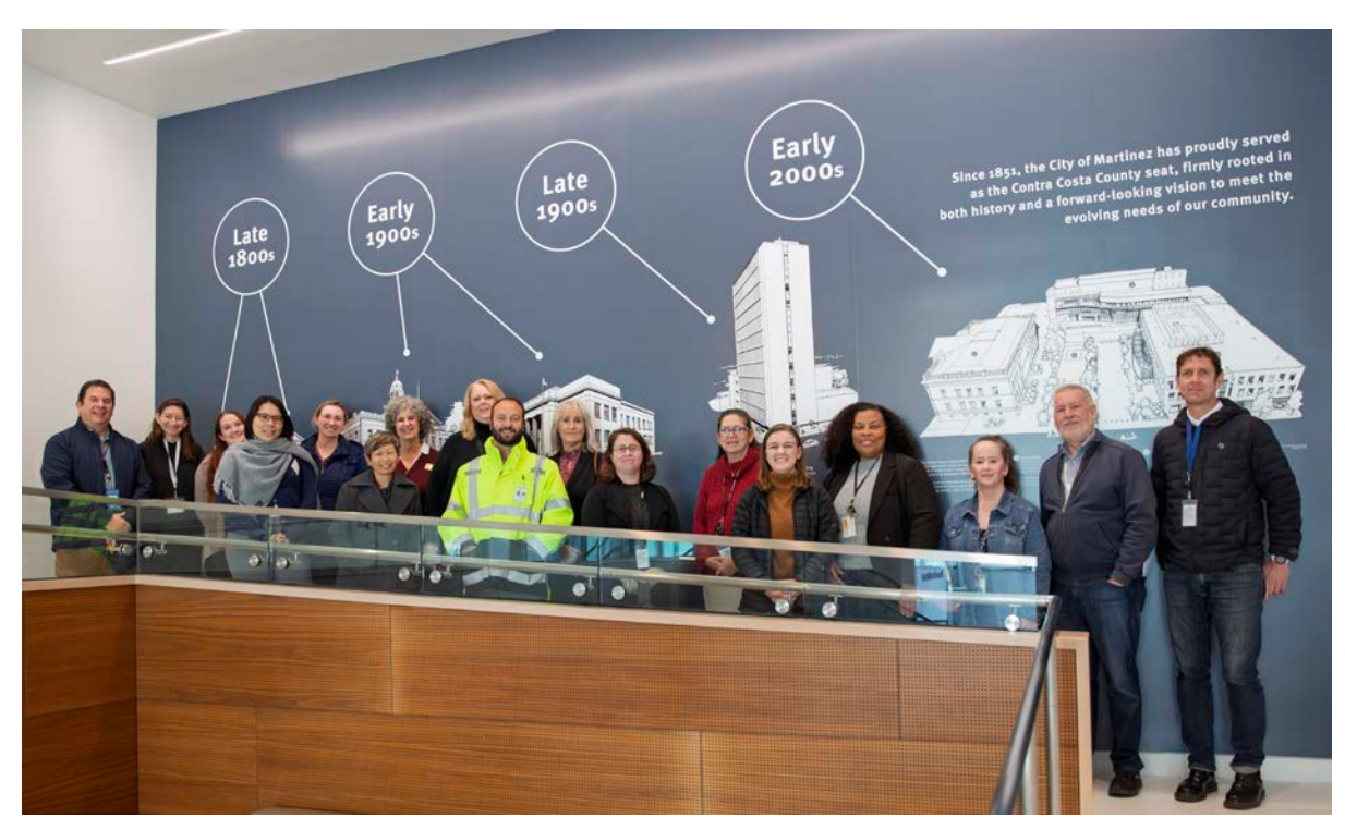
Green Government Group (G<sub>3</sub>) Champions tour the TRUE Gold- and LEED Platinum-certified new administration building at 1026 Escobar St.

The Department of Conservation and Development leads implementation of the CAAP.