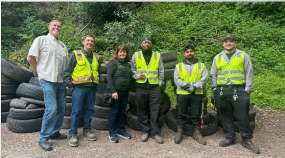
Strategy #14: Waste Tire Amnesty

324 Waste Tires collected by CCEH and PW between 1/1/25 and 6/29/25