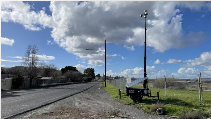
Strategy #46: Surveillance Monitoring

10 mobile surveillance units are currently deployed. A fourth round of deployments will relocate some cameras to new locations, while keeping others in their existing spots