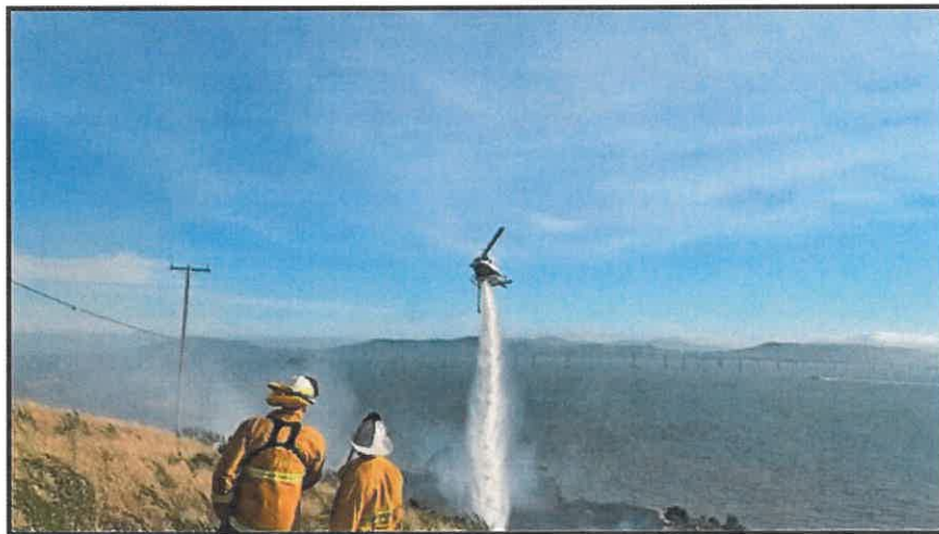
May 27, 2026, Mutual Aid to Richmond at Pont Molate.