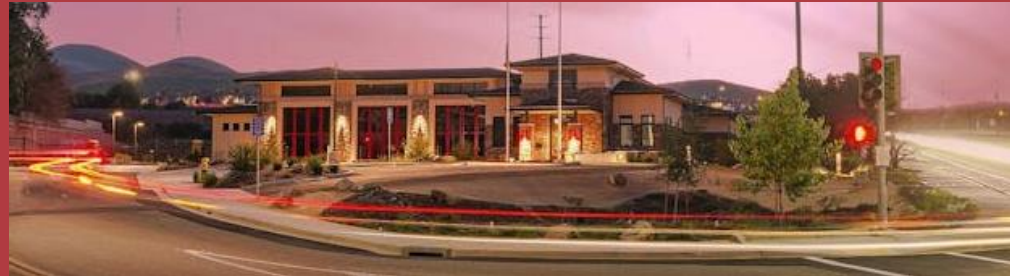
New Bay Point Fire Station 86